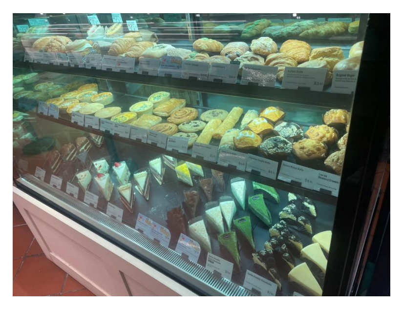
Food lined up in the showcase

I went to Starbucks in Rochester Park with my friend. Unfortunately, it was raining that day, but the white distinctive building was very nice. Another thing that makes Starbucks in Singapore different from Starbucks in Japan is the wide variety of food. I went to Starbucks three times in Singapore, and all of them had a wide variety of food. I was a little surprised to see the difference even in the same Starbucks because Starbucks in Japan has few food items and many drinks.