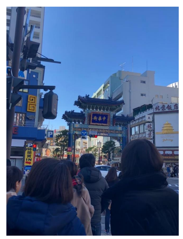
China Town in Yokohama with many Japanese tourists

Little India was very nice! The vibrant markets and unique smells made me feel as if I was really in India. I have never actually been to India, but Singapore makes me feel as if I have been to several countries.