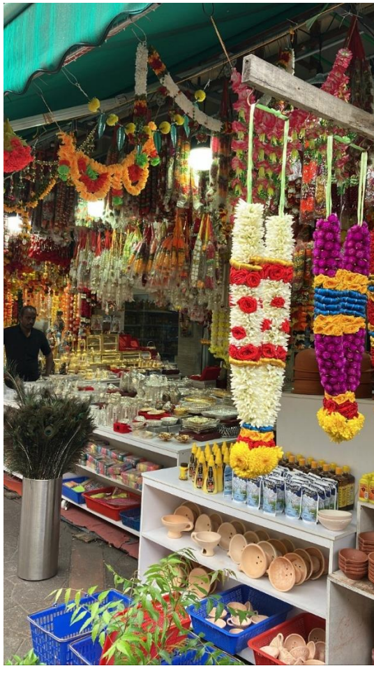
A market in Little India

Little India was very nice! The vibrant markets and unique smells made me feel as if I was really in India. I have never actually been to India, but Singapore makes me feel as if I have been to several countries.